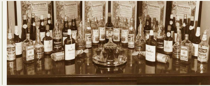
A range of Hamilton's Ewell Vineyards immensely popular, award winning wines.