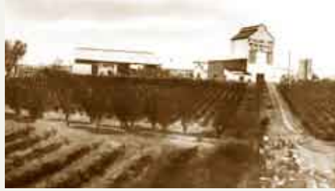
Circa 1880s. The original Hamilton's Ewell Vineyards, Glenelg, South Australia at vintage time.