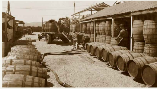
Circa 1930. Loading barrels of wine for export in the 1930s at the original Hamilton's Ewell Vineyards winery near Glenelg, South Australia.