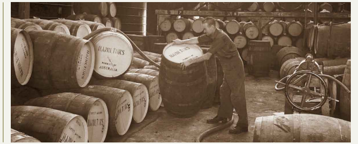
Circa 1930s. Filling 65 gallon (300 litre) hogsheads with wine in the original Hamilton's Ewell Vineyards winery near Glenelg, South Australia.