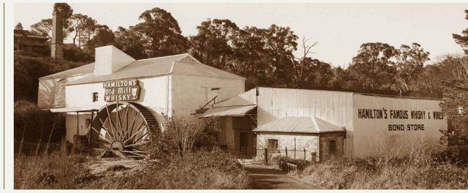
Circa 1960. The Bridgewater Mill used as a Whisky and Brandy Store by Hamilton's Ewell Vineyards in the 60s and 70s until the sale of the company to Mildara in 1979. Now a restaurant and sparkling wine cellar owned by Petaluma Winery.

T here is something of an irony or minor family tragedy demonstrated when The Advertiser newspaper reported the centenary of the establishment of the winery on 10 June 1937 under the header “Winery with Unique History - 100th Birthday of Hamilton's Vineyards - Land Bought in Reign of William IV”.