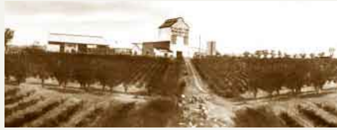
Circa 1880s. The original Hamilton Ewell Vineyards, Glenelg, South Australia at vintage time.